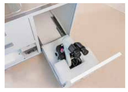
Safe transfer whenever required