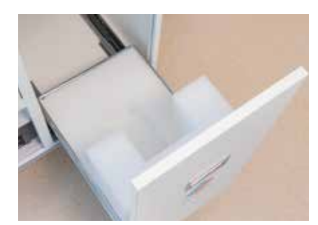
Preformed foam support to hold microscope during transfer