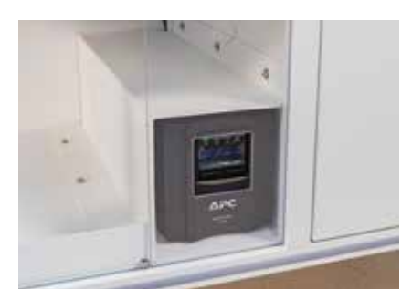
On board UPS Universal Power Supply