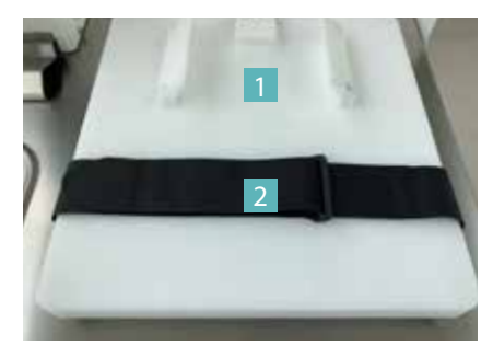
1. Brackets for Olympus CX23 microscope 2. Strap for holding your own microscope